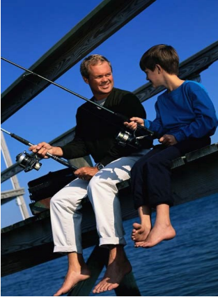
Family Fun—Dad and Son